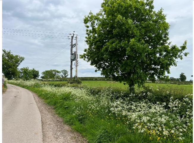
The lane-side hedgerow with a young oak.