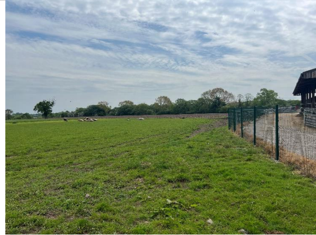
The adjacent improved grassland field.