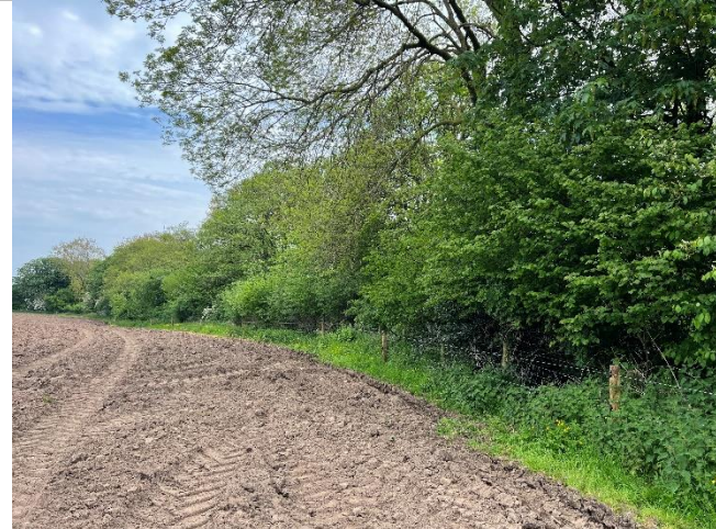
The adjacent woodland habitat to the south.