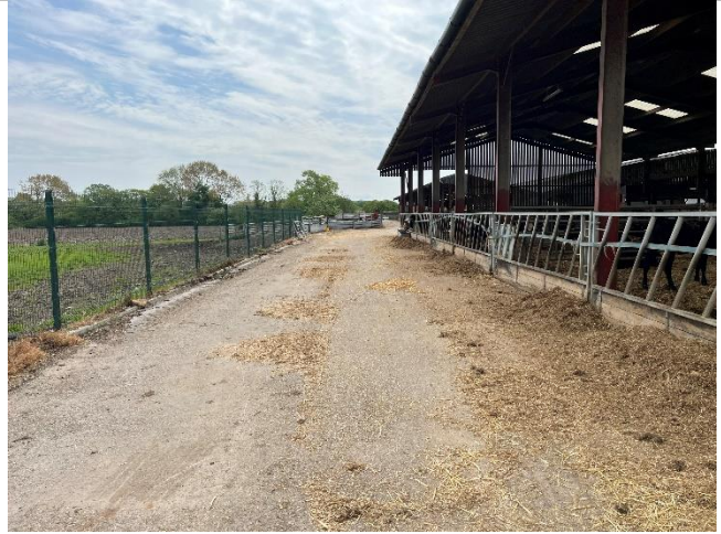
View of the access track, yard and cow sheds.