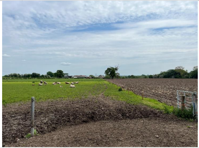
The adjacent improved grassland field.