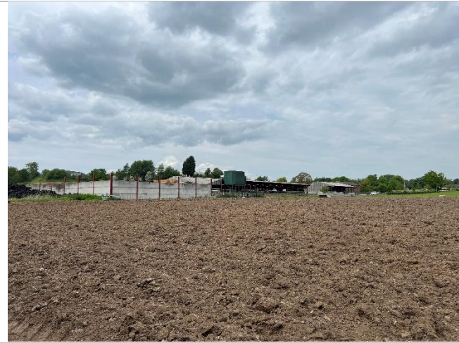
Showing the ploughed arable field and the adjacent waste store and agricultural buildings.