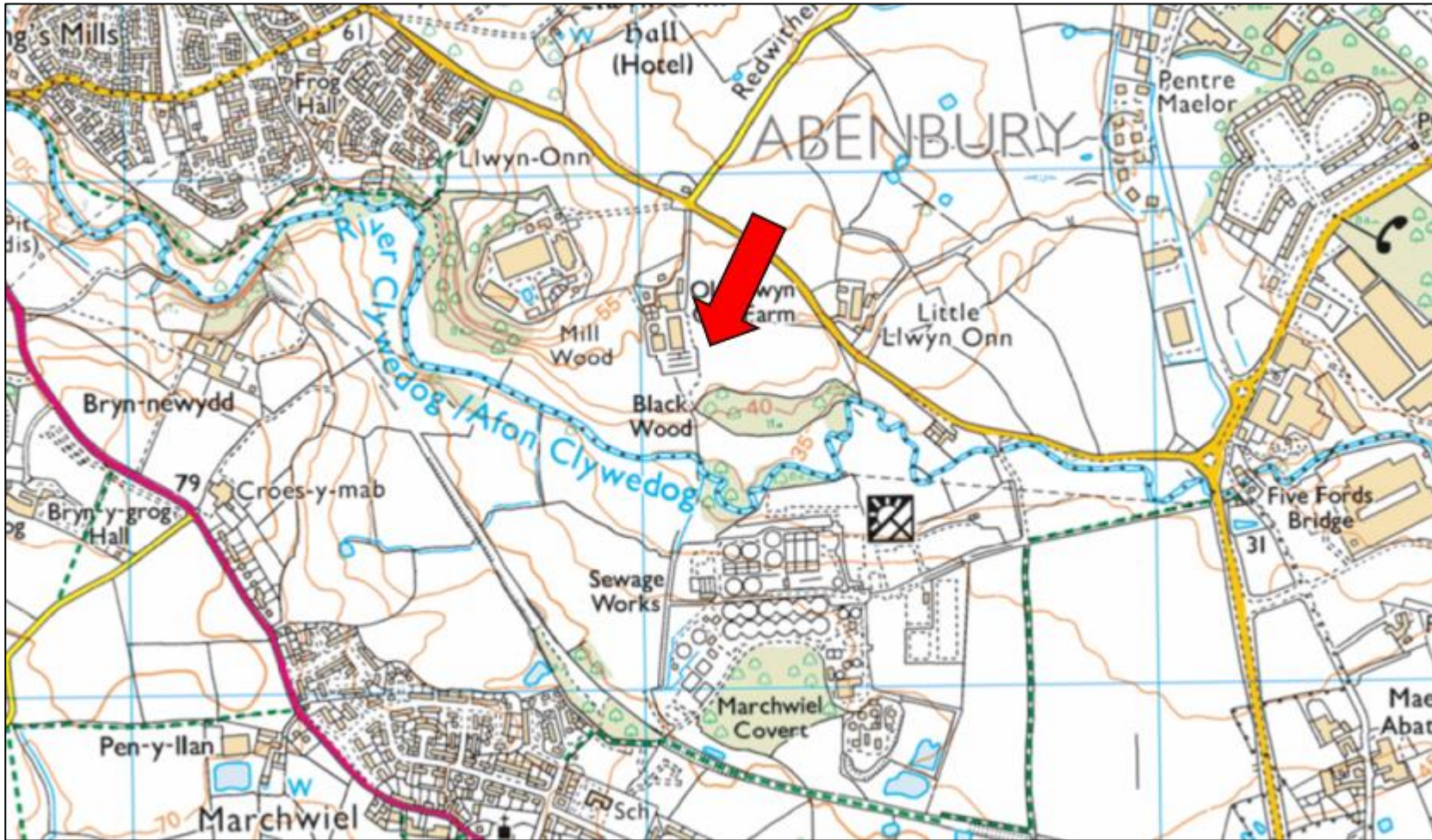
FIGURE 1 LOCATION