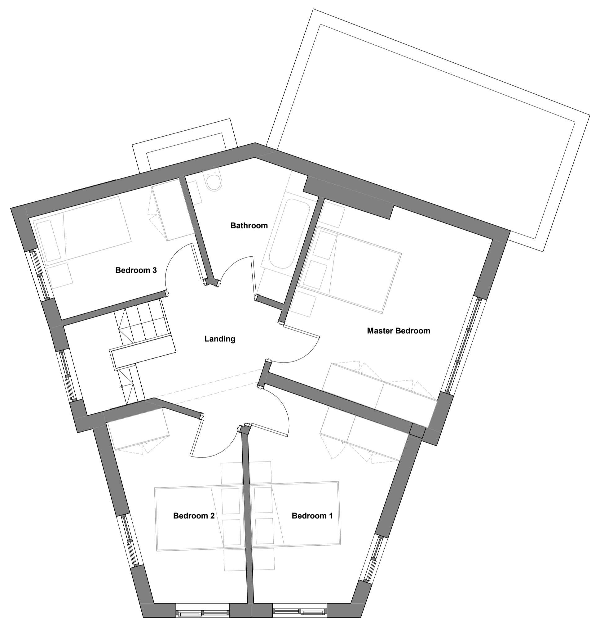
2 Existing First Floor Plan (no changes proposed) Scale: 1 : 50