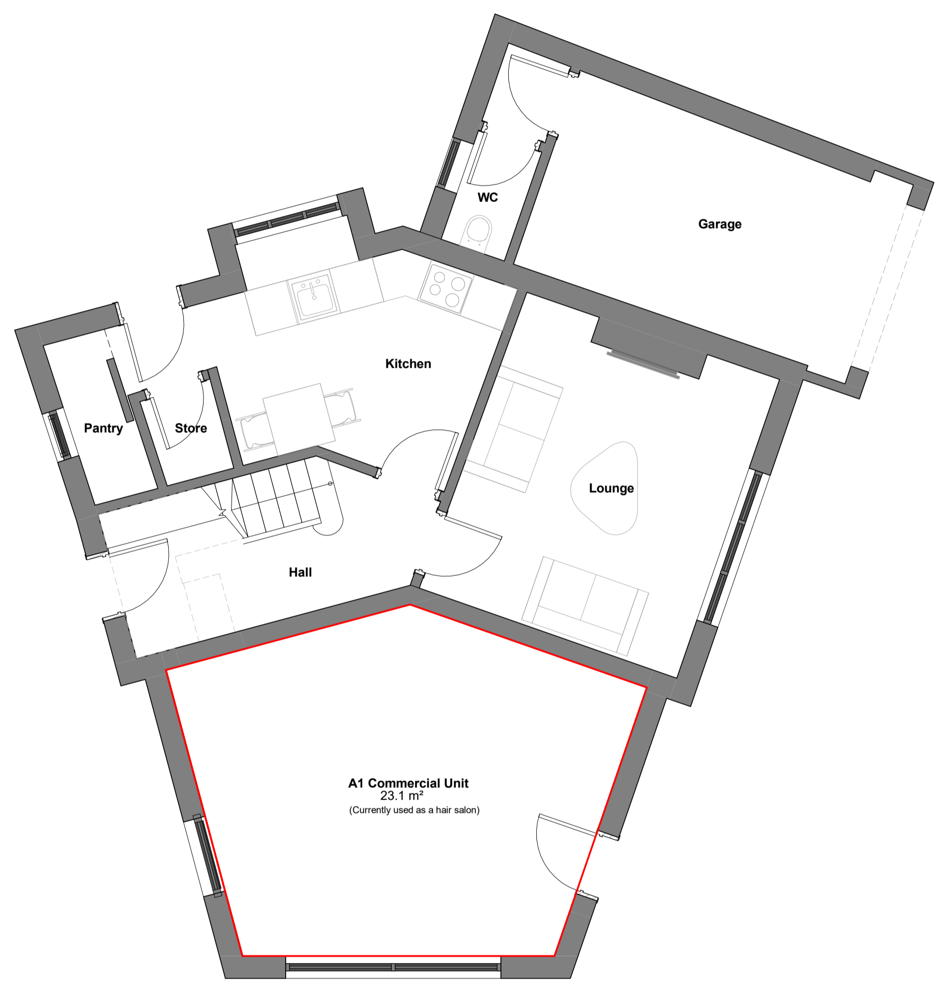
1 Existing Ground Floor Plan Scale: 1 : 50