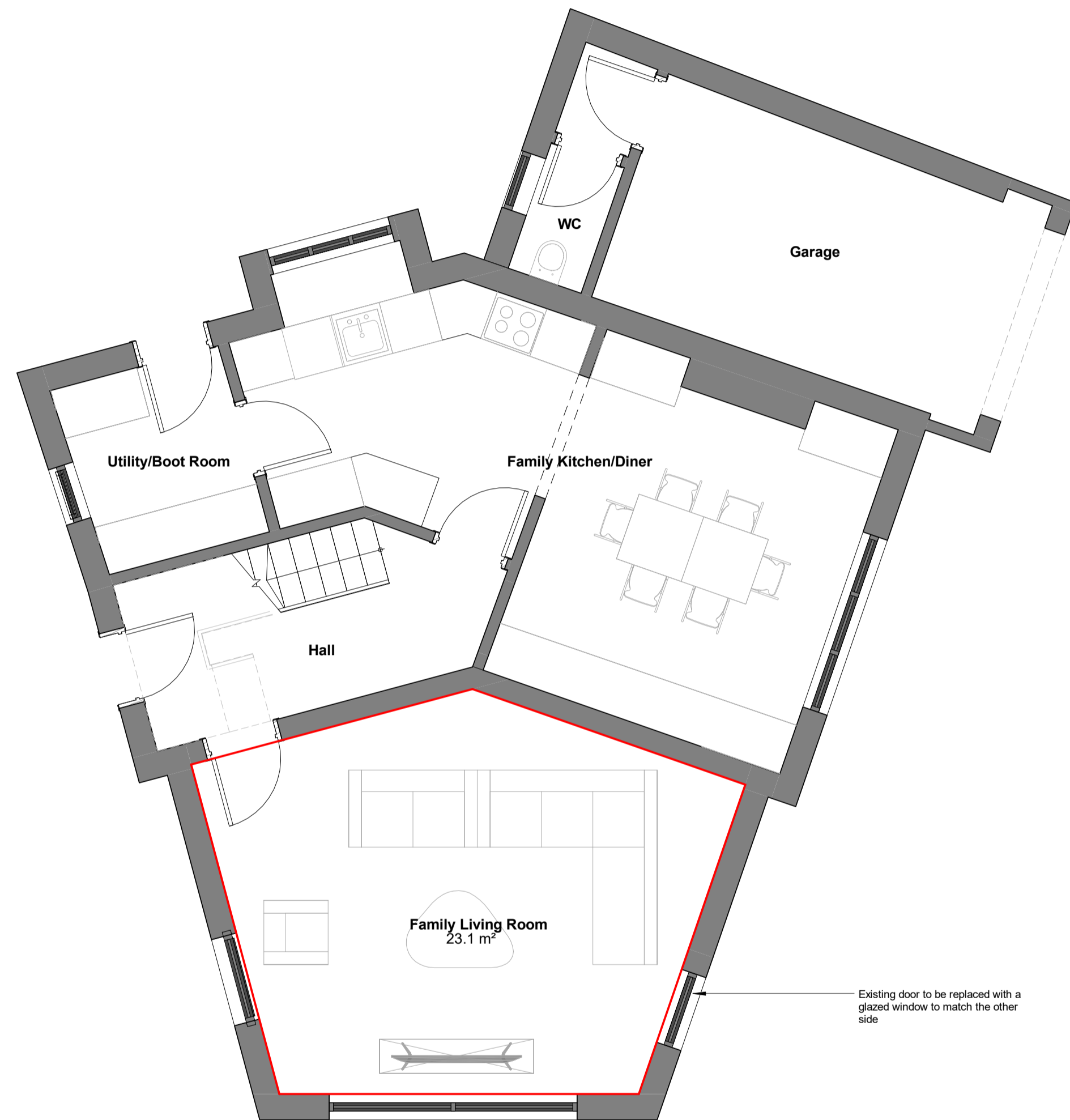
1 Proposed Ground Floor Plan Scale: 1 : 50