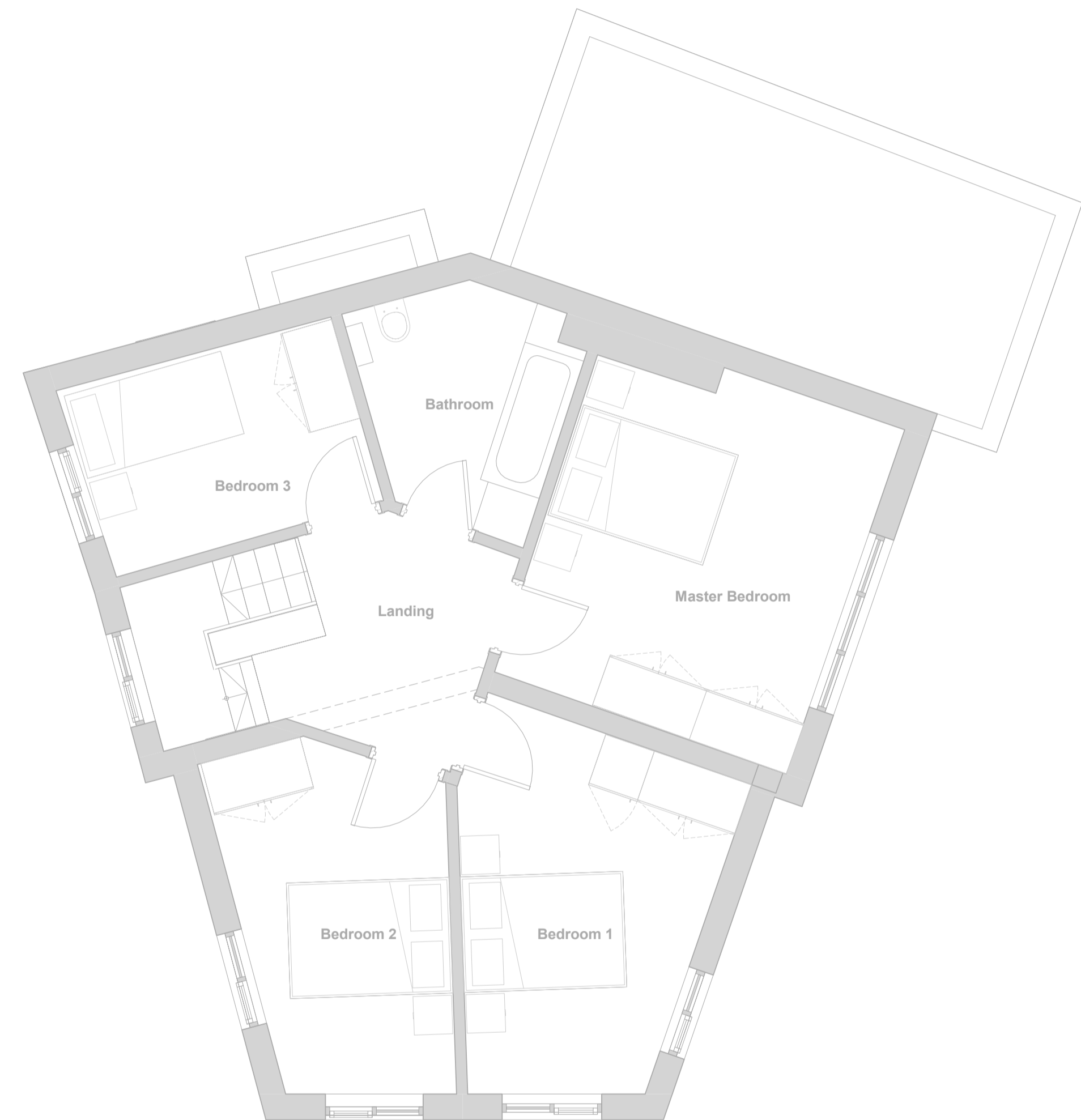
2 First Floor Plan (no changes proposed) Scale: 1 : 50