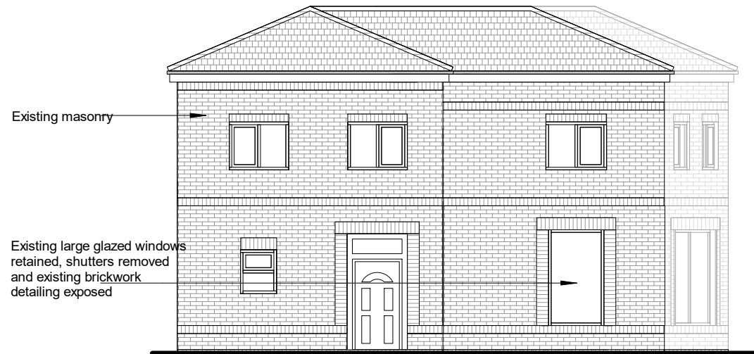
1 North Elevation (Holt Road) Proposed Scale: 1 : 100