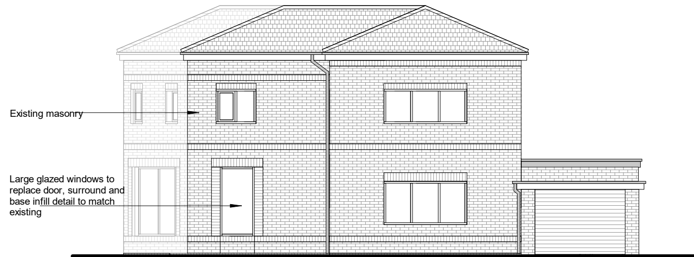
3 South Elevation (Hullah Lane) Proposed Scale: 1 : 100