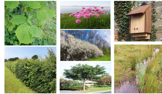
LANDSCAPE FEATURES TO BENEFIT PEOPLE AND WILDLIFE

GREEN INFRASTRUCTURE (GI) IS DEFINED BY THE UK GOVERNMENT AS A "NETWORK OF MULTI-FUNCTIONAL GREEN SPACE, URBAN AND RURAL, WHICH IS CAPABLE OF DELIVERING A WIDE RANGE OF ENVIRONMENTAL AND QUALITY OF LIFE BENEFITS FOR LOCAL COMMUNITIES". THIS CAN INCLUDE NATURAL HABITATS RANGING FROM GRASSLANDS, WETLANDS AND WOODLANDS TO PARKS, OPEN SPACES, PLAYING FIELDS, STREET TREES, RAIN GARDENS, ALLOTMENTS AND PRIVATE GARDENS.