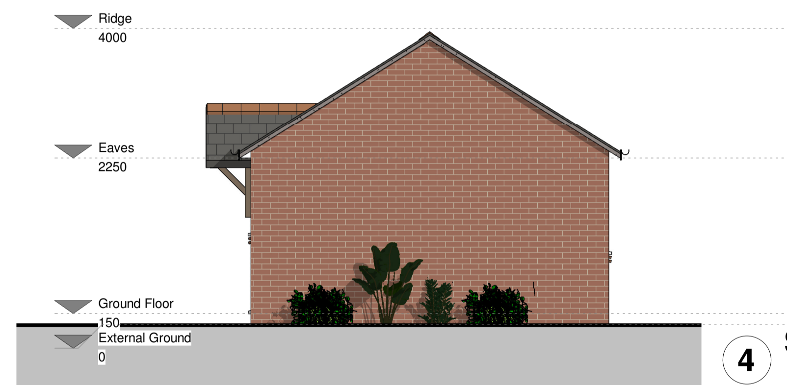
4 SIDE ELEVATION (SOUTH-WEST) 1 : 50