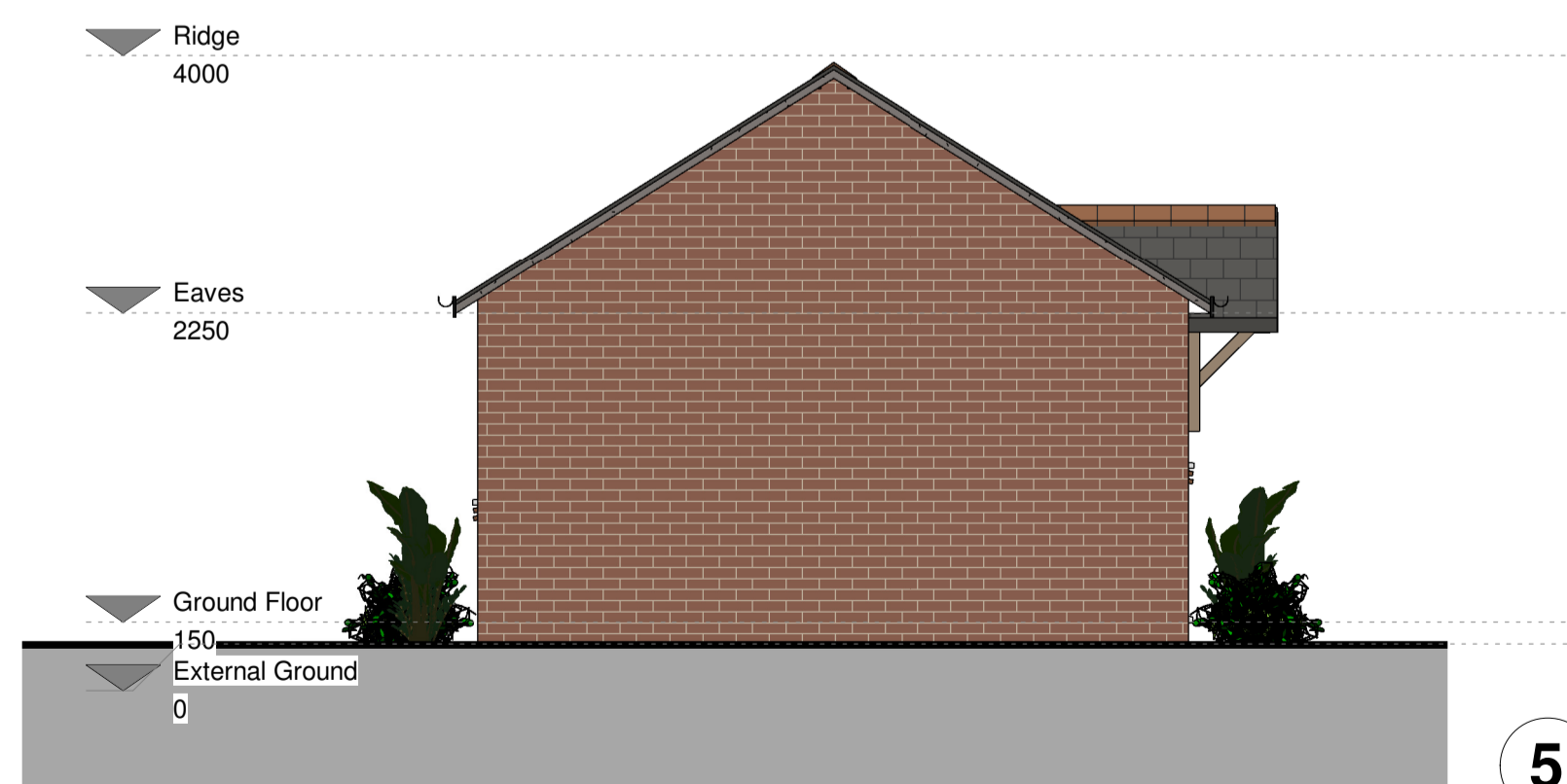
5 SIDE ELEVATION (NORTH-EAST) 1 : 50