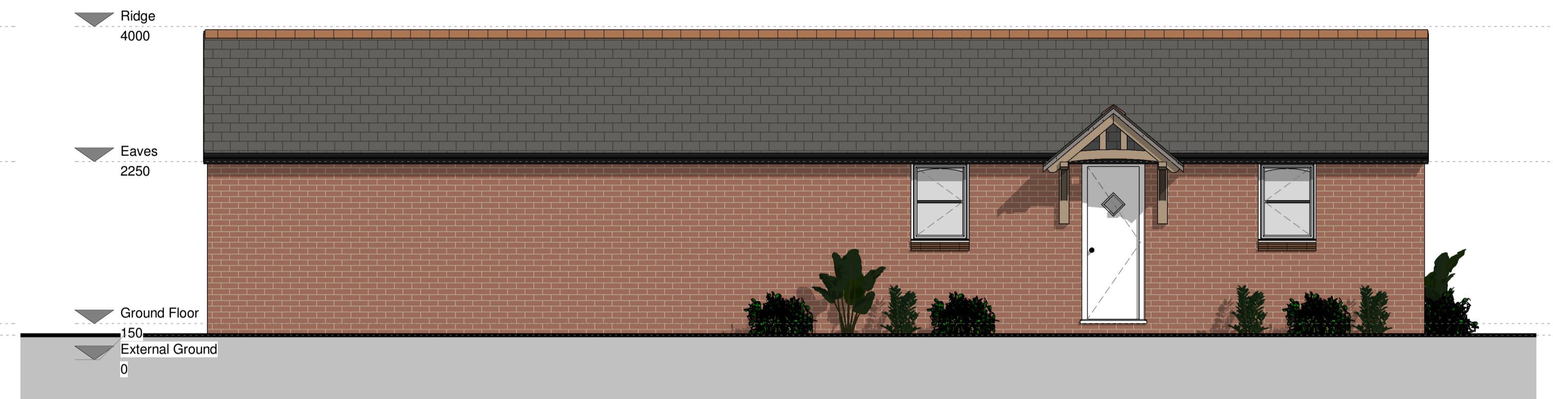
3 REAR ELEVATION (NORTH-WEST) 1 : 50