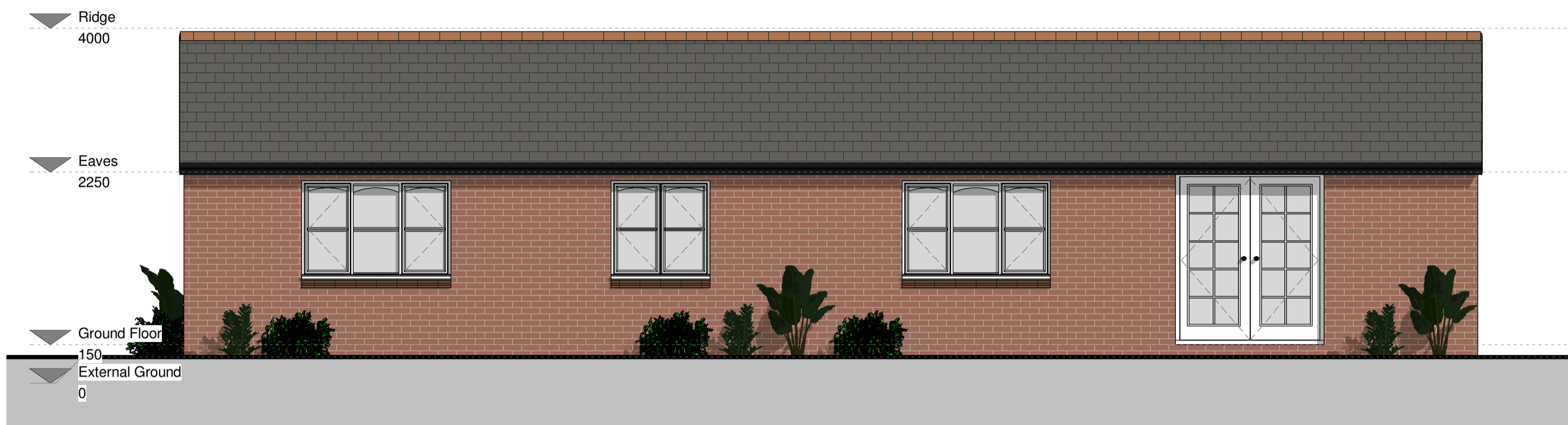
2 FRONT ELEVATION (SOUTH-EAST) 1 : 50

The content of this drawing is subject to the provision of the Copyright Act 1956. Work to figured dimensions only. Site dimensions are to be checked before work is started. Any discrepancy whatsoever between any information contained on this drawing and any other document or drawing must be drawn to the attention of the Architect by the contractor before the work is executed. IF IN DOUBT ASK IMMEDIATELY.